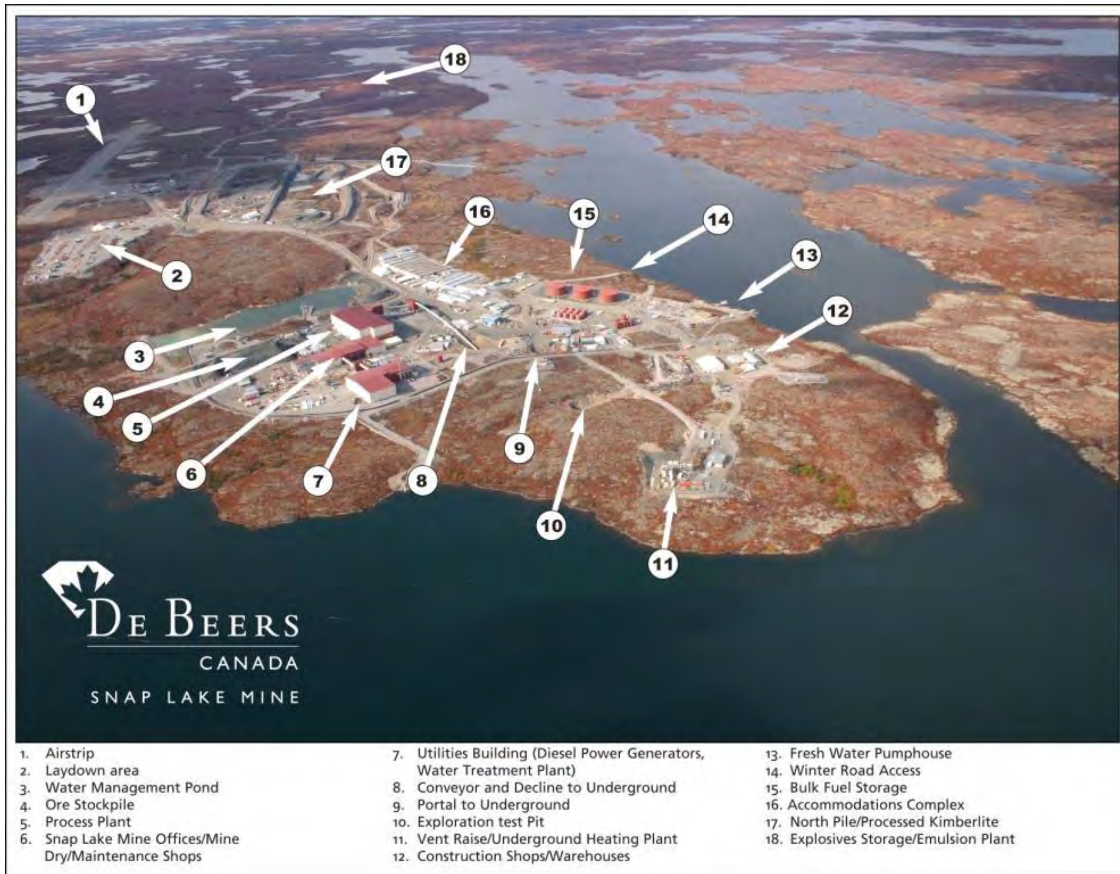
Figure 1: Site Plan for the Snap Lake Mine