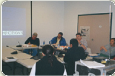
Fort Simpson Public Hearing, 2006