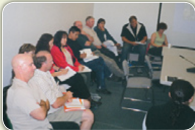
Fort Simpson Public Hearing, 2006