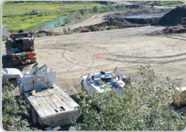
Cantung mine site

The public hearing is the most visible part of the work the MVLWB carries out. It is an opportunity for any interested person to give his or her views on a proposed activity. The public hearing is an important element of the democratic political system in which we live - it is one of the valuable privileges we enjoy as residents of Canada.