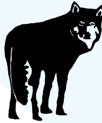
GWICH'IN LAND AND WATER BOARD

The objective of the NWT Board Forum is to give industry, government, and other organizations a structured forum for engagement, with the intent of providing an integrated and coordinated resource management system for the Northwest Territories.