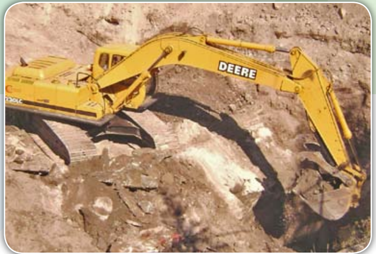
Excavator preparing site for the installation of a shaft cap, part of Con Mine C and R Plan, 2007.

Those who write the terms and conditions for permits and licences study applications and determine appropriate closure and reclamation measures. For instance, if a project disturbs the land, the contractor must save the organic soil stripped from the excavation area and return it before the expiry date of the Permit. Contractors may also