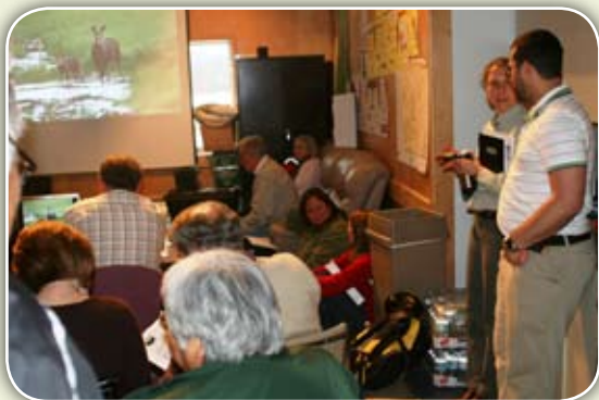
North American Tungsten public hearing at Nahanni Butte, October 2008