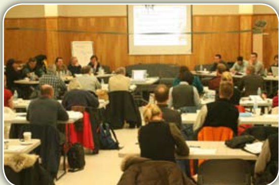
North American Tungsten public hearing at Fort Liard, October 2008