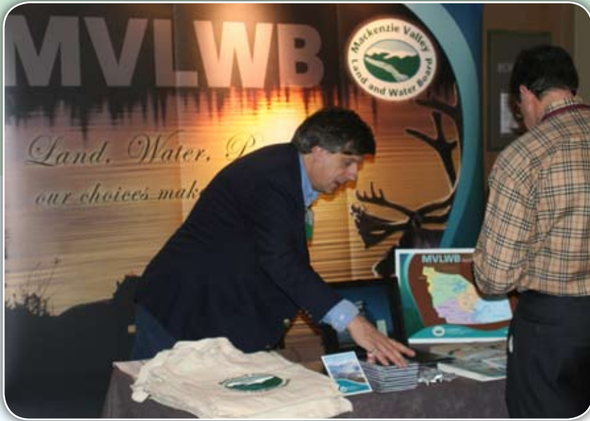
MVLWB Display Booth