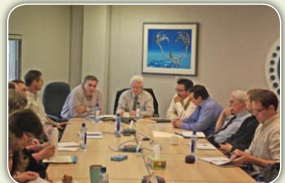
Release of the McCrank Report, Yellowknife, July 2008.