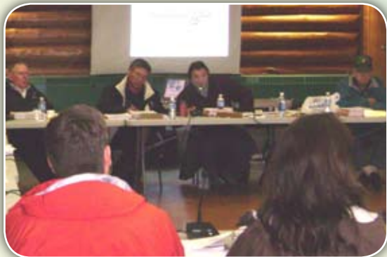
Tamerlane Ventures public hearing at Fort Resolution, September 2008.