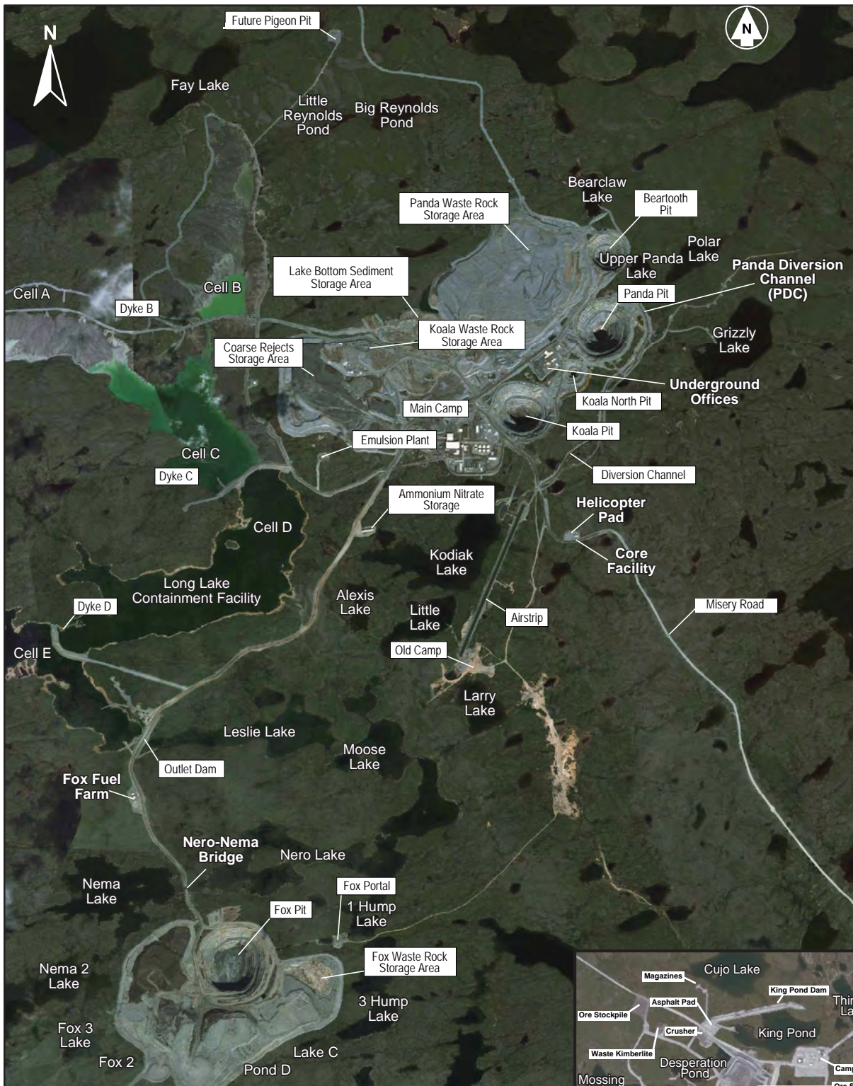
EKATI Diamond Mine - Main Camp Area