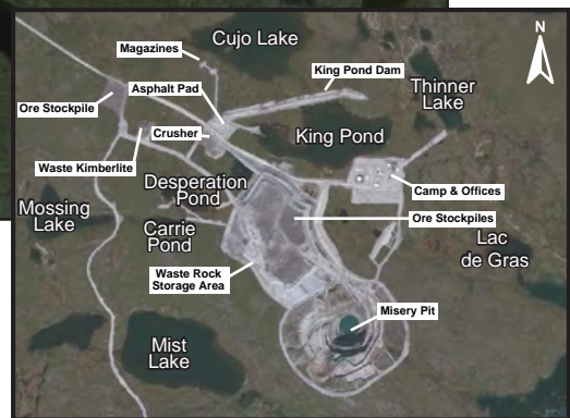
EKATI Diamond Mine - Misery Area